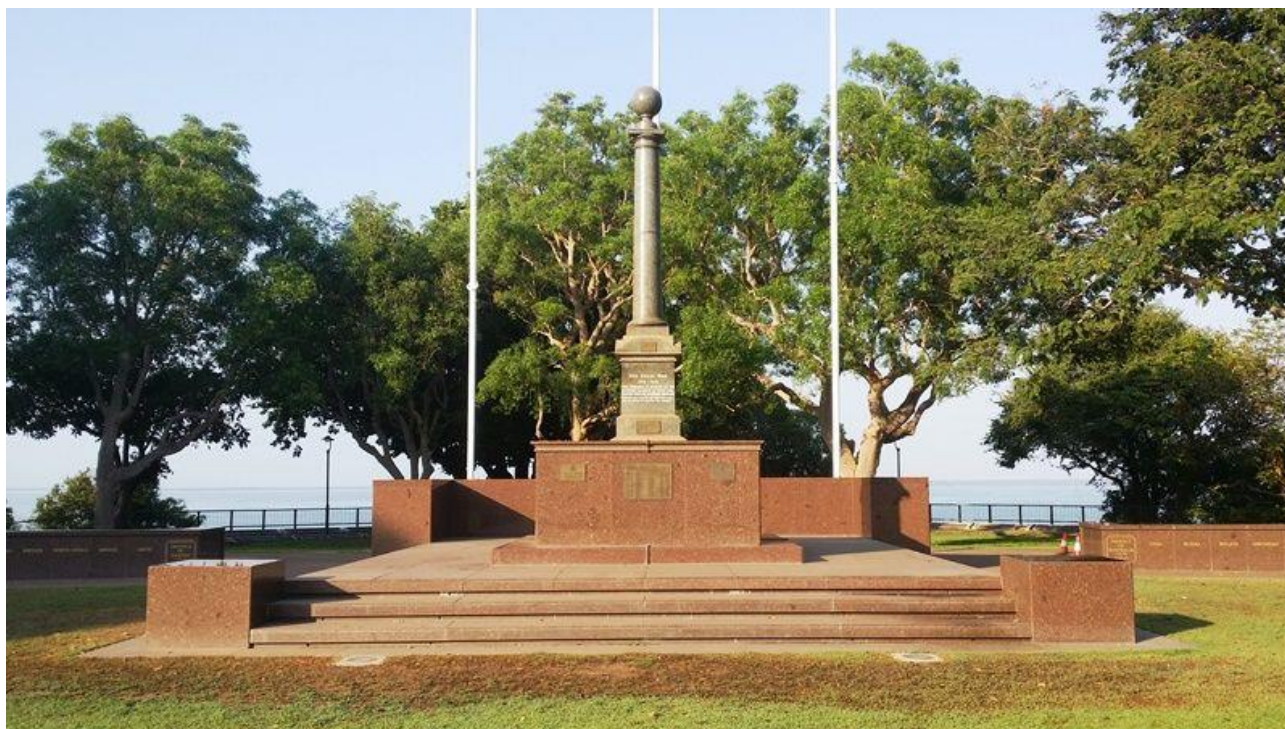
Darwin Cenotaph