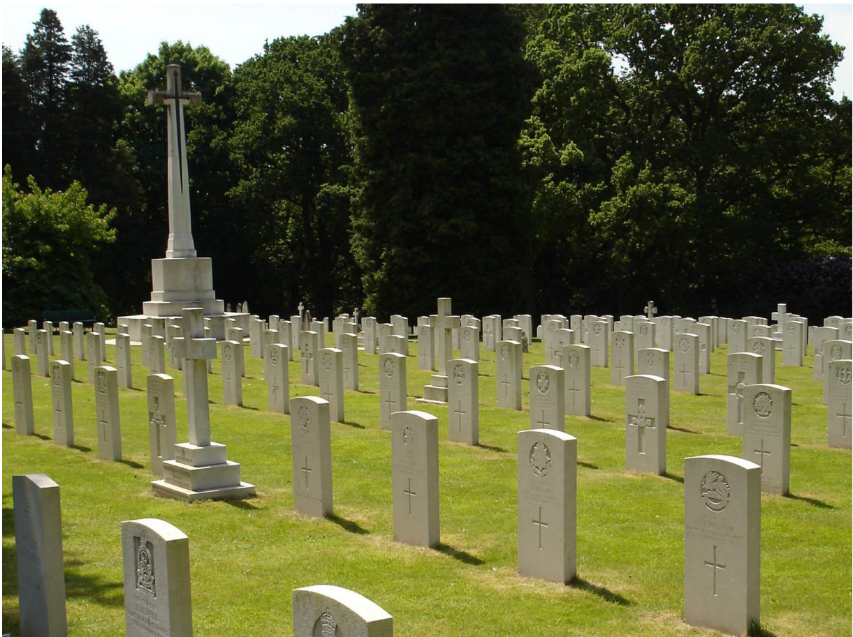
Netley Military Cemetery, Hampshire

THE COMMONWEALTH WAR GRAVES COMMISSION IS RESPONSIBLE FOR THE MAINTENANCE OF THESE GRAVES