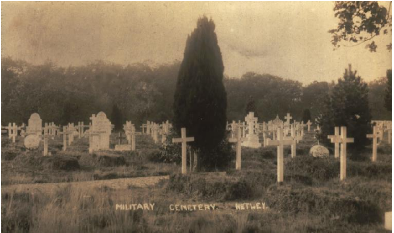
Original Cross markers – Netley Military Cemetery