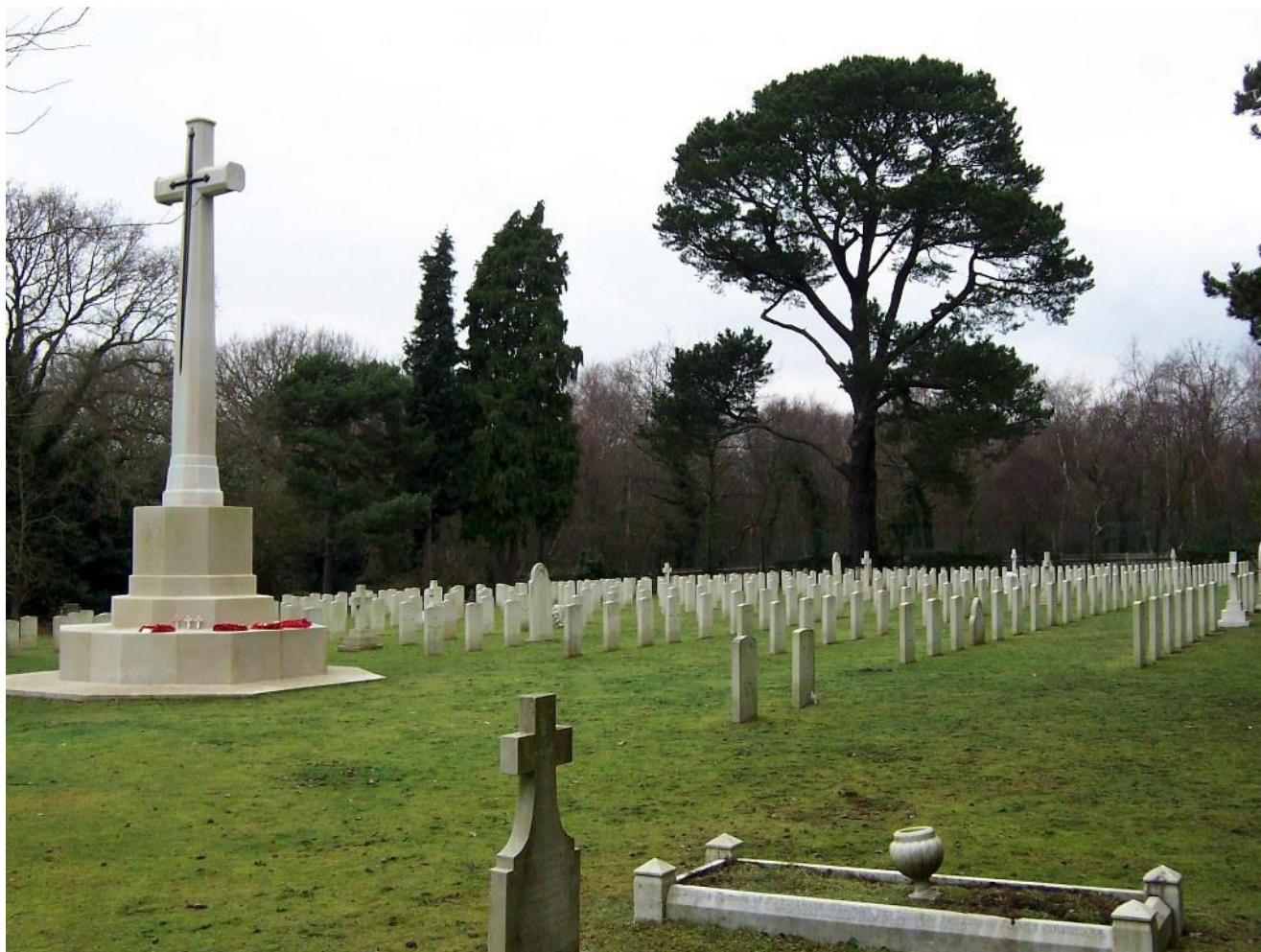
Netley Military Cemetery, Hampshire